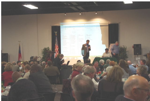
Number drawn for Last Jack Reverse Raffle; 80 of 100 raffle tickets sold allowed us to give $4000 in cash prizes and another $500 in prizes, such a beautiful wine basket from the Cork Boutique. 50% of the money from tickets sold goes into the prize pool..