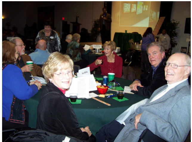
The Joe Willis Table.