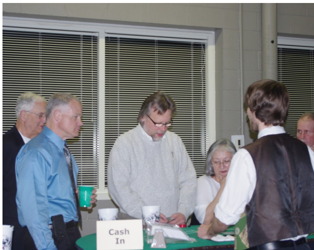
Black Jack Tables